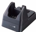
Charging and communication cradle