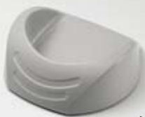
> AS-8000 holder