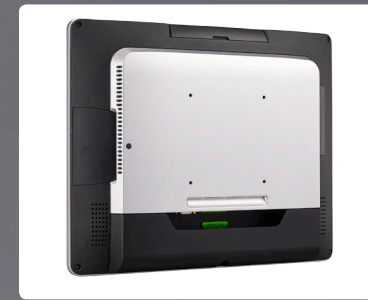
Standard VESA wall mount option