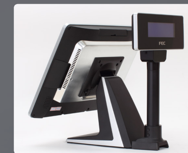
Integrated Pole Type Customer Display