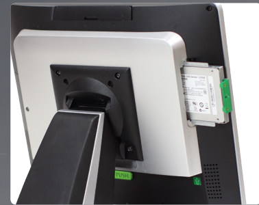
Equipped with 2.5" SATA drive slot and onboard M.2 SSD storage (option)