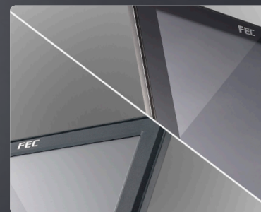
Choice of traditional bezel & true flat options