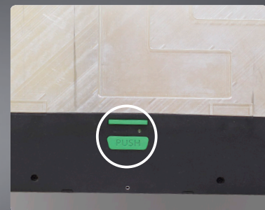
One touch access to remove the main unit.