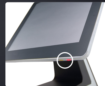
Improved power button & status LED design