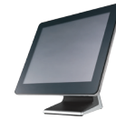
15" P-CAP Bezel-Free