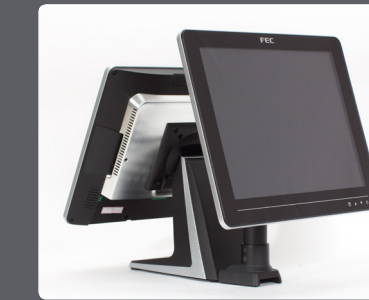
Integrated Pole Type 15inch Display