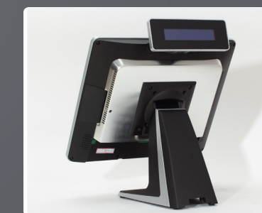
Integrated Customer Display