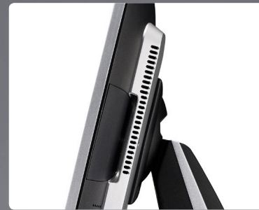
Smart Fan detects CPU temperature and adjusts fan speed automatically